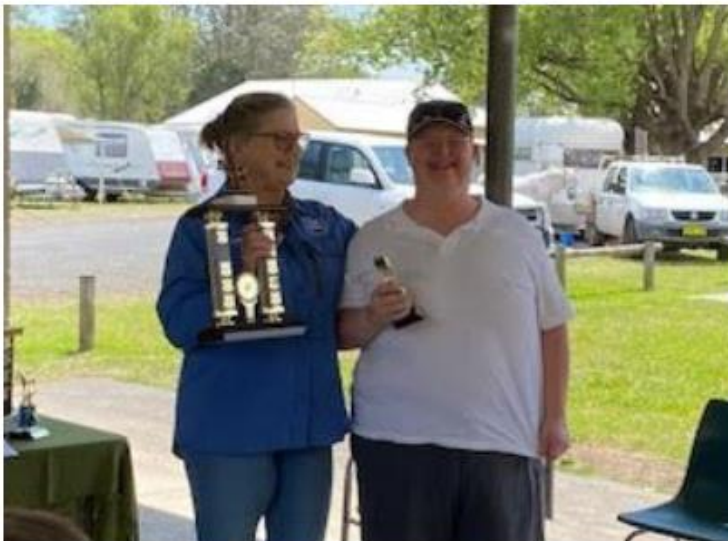
Rider/driver of the year Tim Henman