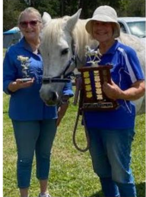
Horse of the year - Tinker